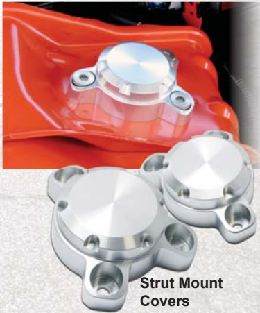
Strut Mount Covers