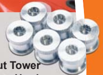
Strut Tower Brace Hardware

A great addition to our Challenger Strut Tower Brace or Strut Mount Covers! These machined stainless steel nuts are designed to replace your stock strut tower hardware for a completed look. Features a torx head top with knurled edge.